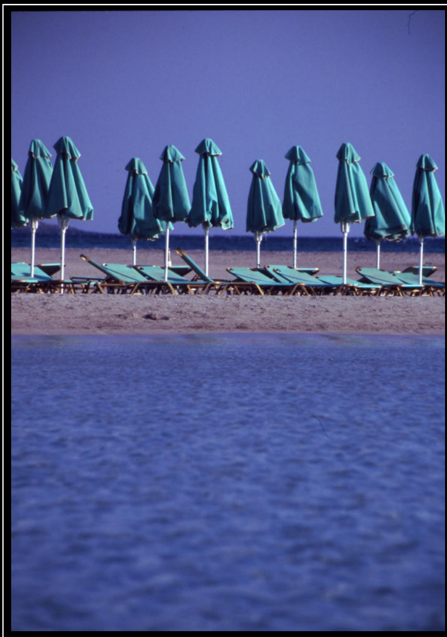
© If you need refreshment, abandon once a while structure, order and adaption. ☺ Formation for parasols has closing time on the beach of Elafonisi in the very South-West of Crete – October 2008