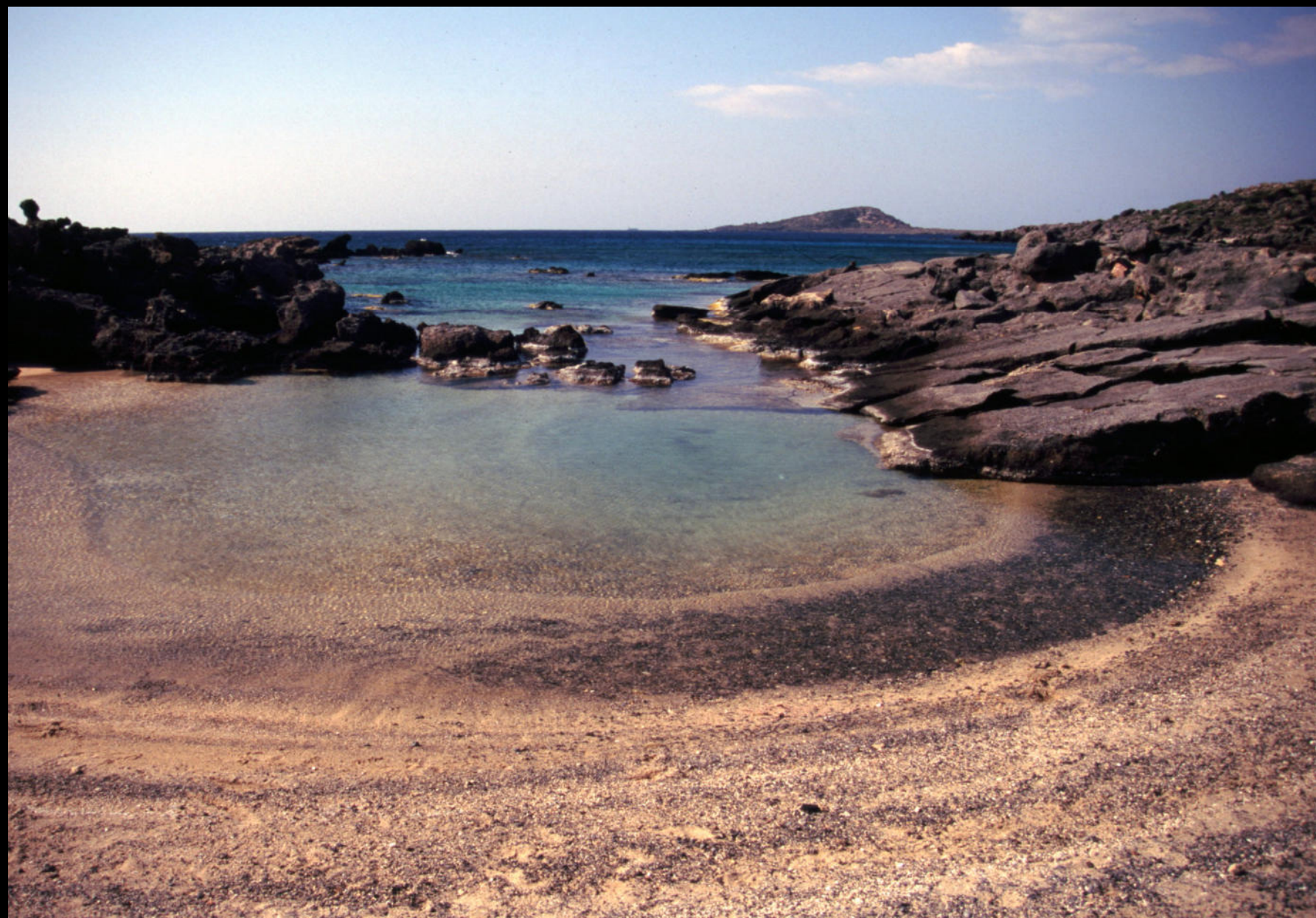
☺ If your thoughts go round in circles, concentrate on your centre. ☺ Fantastic bay for swimming at the fine beach of Elafonisi in the very South-West of Crete – October 2008